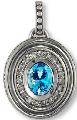
Gem Diamond and Blue Topaz Pendant

Your order can be placed entirely online. If you would like to create a piece that is more unique, contact our Customer Service Department and one of our master artisans will be glad to work with you to make your one of a kind piece.